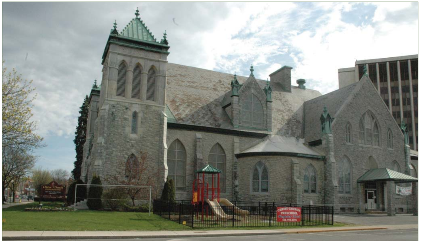
The closing session of Troy Annual Conference will be held Saturday, May 22, at Christ United Methodist Church, above. The church is located at 54 Bay Street in Glens Falls, N.Y. Parking is available in the church lot as well as the lot on the north side of Washington St. A retirees' celebration will be held on Friday night, May 21, at the church, beginning at 7 p.m.

Do not include any personal notes, money or additional materials in the kits. These things must be painstakingly removed and will delay the shipment. For more information, visit http://new.gbgm-umc.org/Umcor/ .