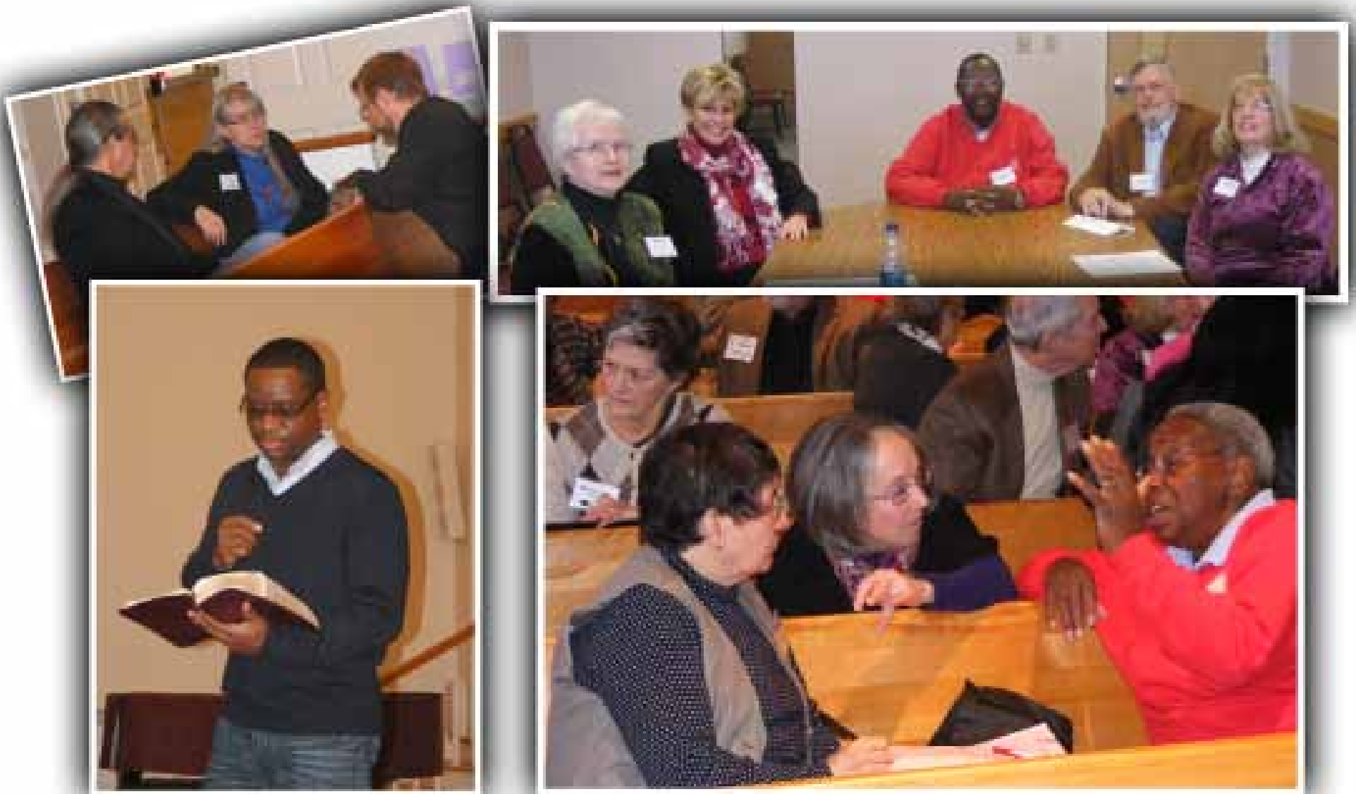
Feb. 12: Members of the Conference Leadership Team met with advocacy ministries leaders for a conversation on the new Conference formation as a journey and not a destination. In attendance were members from several advocacy agencies and teams including General Commission on Religion and Race and Older Adult Ministries.