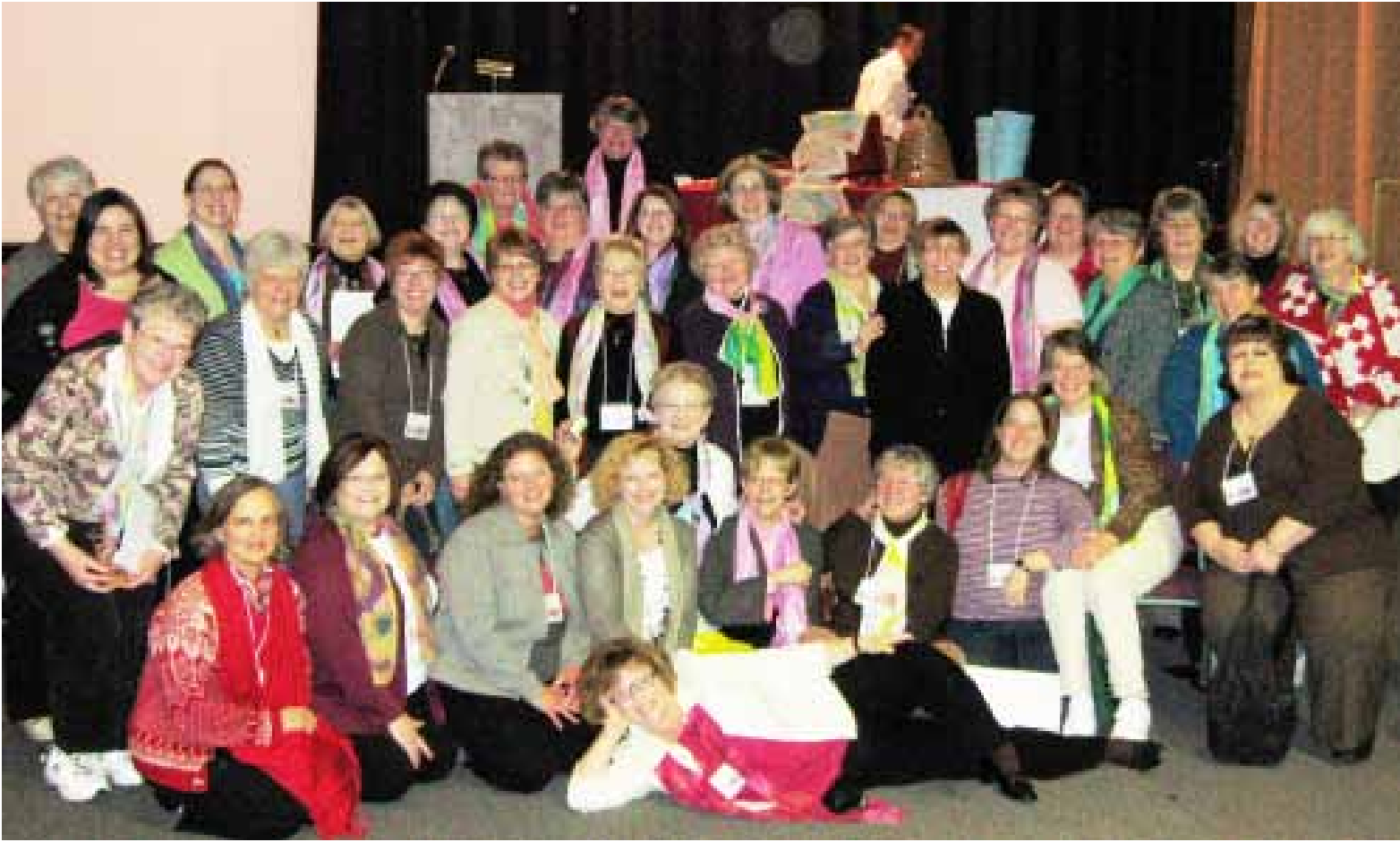
Dozens of female clergy from the Upper New York Annual Conference pose for a photo during the 2011 NEJ Clergywomen's Consultation held in Lancaster, Pa., Feb. 26-March 2.