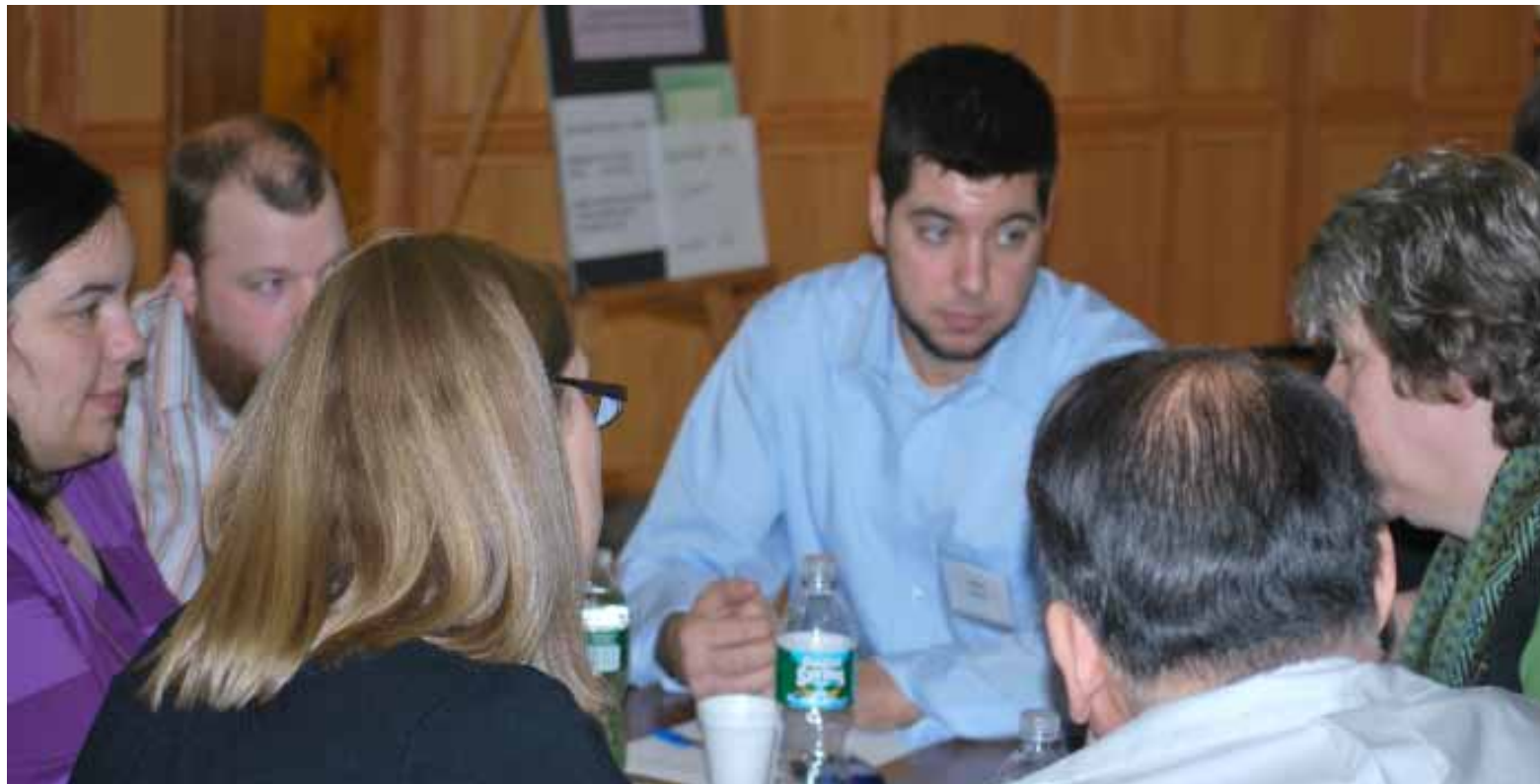
Some members of the Connectional Table of the Upper New York Annual Conference discuss matters of the conference during their meeting at Liverpool First United Methodist Church in Liverpool, N.Y. early this month.