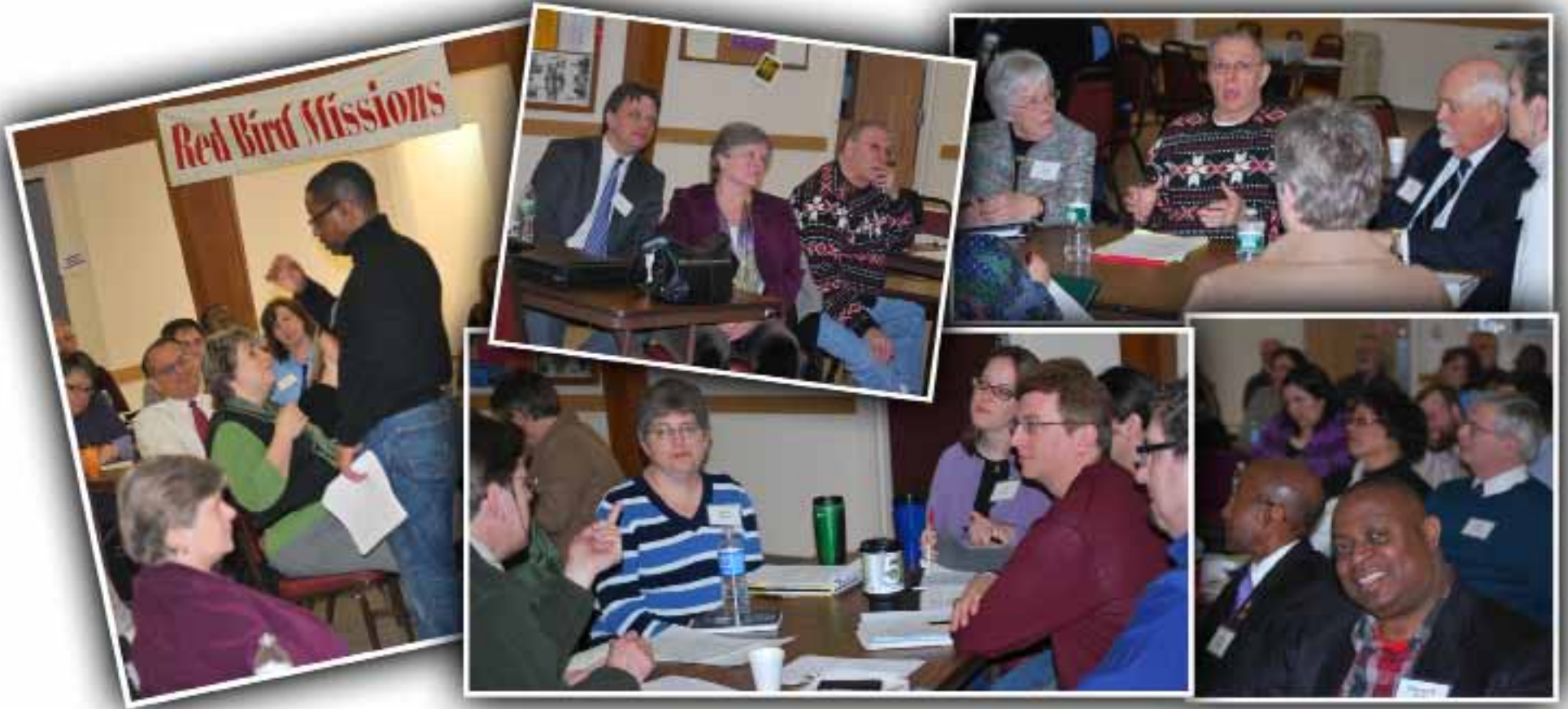
March 5: Connectional Table Members met to discuss the progress of the Upper New York Annual Conference. In attendance were the chairpersons or representatives of various Conference agencies and committees, members of the Management Team, members of the Conference Leadership Team, members of the Appointive Cabinet and district lay leaders.