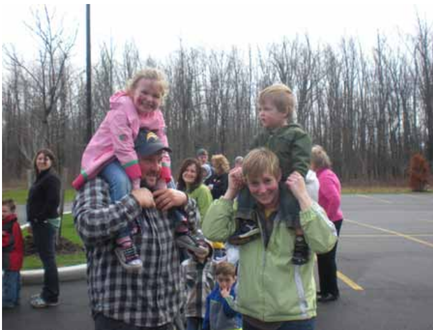
The Amherst: Asbury United Methodist Church held an Easter Egg Hunt this spring as part of its outreach efforts.

"We have to keep moving forward," he said. "I made up my mind, if there were two of