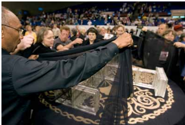
Supporters of full inclusion for gays and lesbians in The United Methodist Church drape the communion table in black cloth during a time of witness at the 2008 United Methodist General Conference in Fort Worth, Texas. Petitioners are seeking to bring the issue to the 2012 General Conference in Tampa, Fla.

Two petitions are seeking the removal of "exclusive" and "condemnatory" language on homosexuality in Paragraph 161F of the Book of Discipline